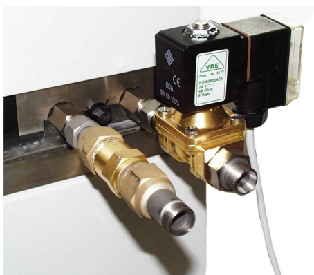
Fig. 2: Shut down valve Figure 1